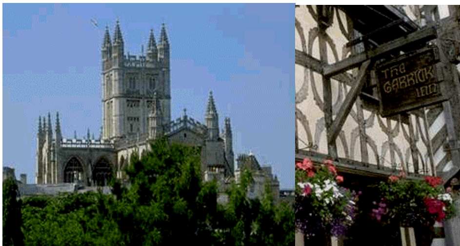
Images of Chichester

Presenter – Well I hope you enjoyed our brief tour of the town of Chichester. It is certainly very different from today! As for me I prefer 2001 to 1397. At least you don't get a chamber pot tipped all over you!