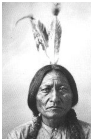
Chief Sitting Bull

The battle ended in a big defeat for the army. All the men were killed by the Sioux Indians.