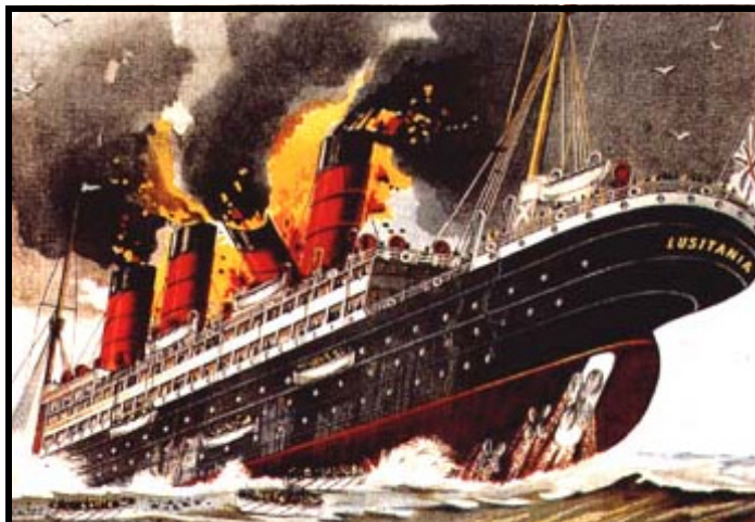
The sinking of the Lusitania