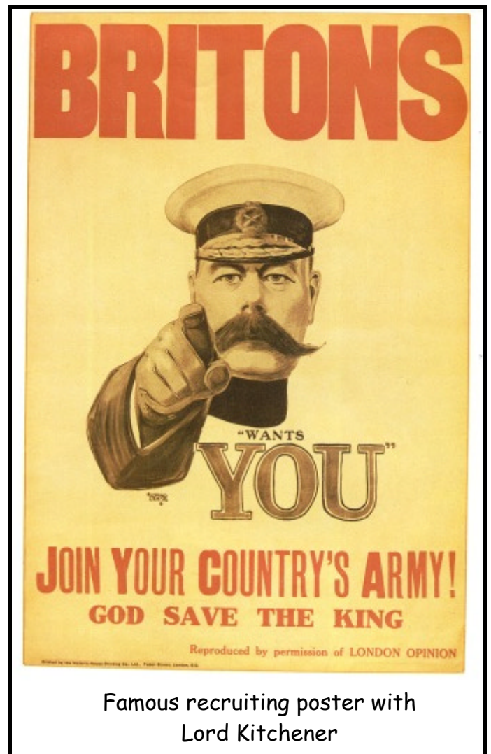
Famous recruiting poster with Lord Kitchener